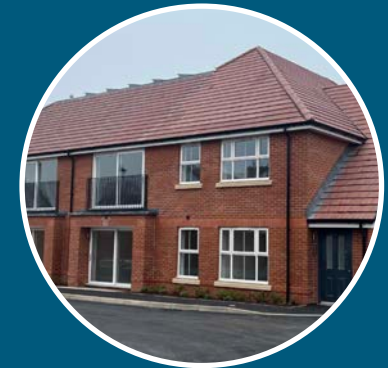
Squires Garden, Windsor