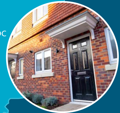
Mangrove Road, Hertford