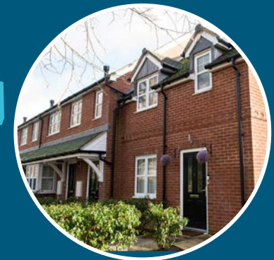
Springett Place, Amersham

We are seeking a range of development opportunities across our key investment area.